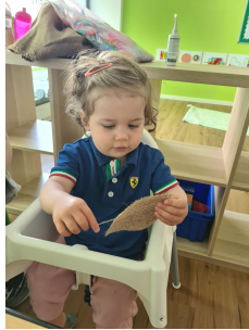
Weight and volume