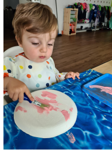
Pre-writing mark making