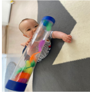
Weight and volume