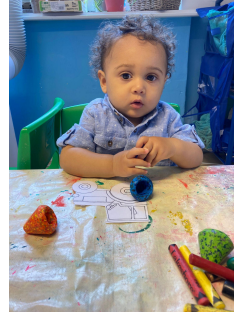
Pre-writing mark making